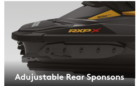
Adjustable Rear Sponsons

Limits bow rise and improves performance in all water conditions.