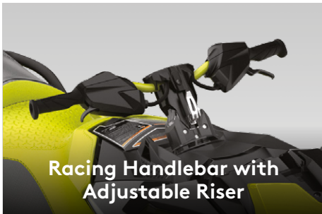
Racing Handlebar with Adjustable Riser

A narrow seat profile with deep knee pockets lets riders sit naturally and use the leg muscles to hold onto the machine for more control.