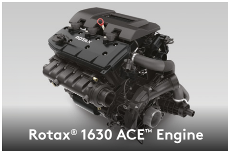
Rotax® 1630 ACE™ Engine

The Rotax® 1630 ACE™ is the most powerful Rotax® engine ever, delivering high efficiency and amazing acceleration.