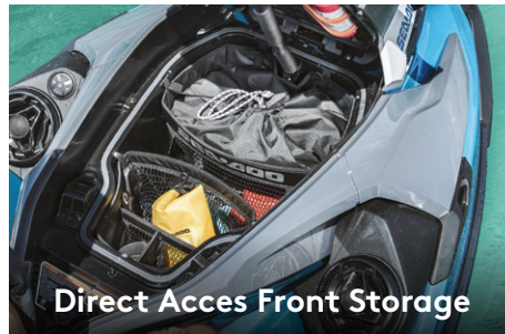
Direct Access Front Storage

An innovative hull that sets the benchmark for rough water handling, stability, and offshore performance.