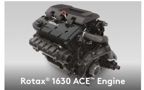
Rotax® 1630 ACE™ Engine

Large front storage area that's easily accessible from a seated position. 1