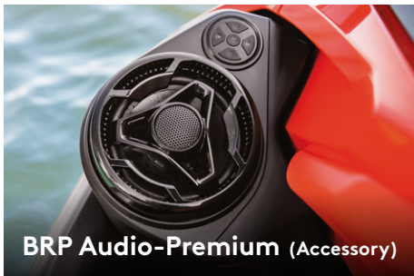
BRP Audio-Premium (Accessory)

An industry-first manufacturer-installed, truly waterproof, Bluetooth ® audio system.