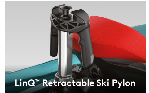
LinQ™ Retractable Ski Pylon

An industry-first manufacturer-installed, truly waterproof, Bluetooth † audio system. 2