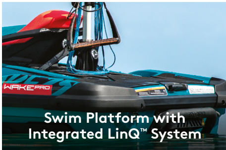
Swim Platform with Integrated LinQ™ System

Exclusive quick-attach system on the largest swim platform in the industry that allows for easy installation of accessories. 1